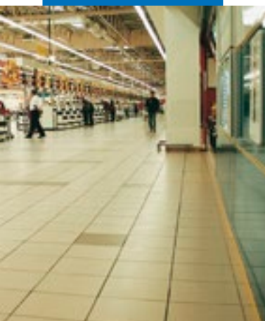
An example of an installation with Keraquick S1 in an Auchan supermarket - Sosnowiec (Poland)