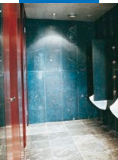
An example of the installation of marble to walls with Keraquick S1 - Feuchtwangen casino bathroom (Germany)

as Mapecem, Mapecem Pronto, Topcem or Topcem Pronto , ready-mixed mortars.