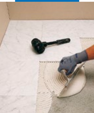
Setting white Carrara marble with Keraquick S1 white