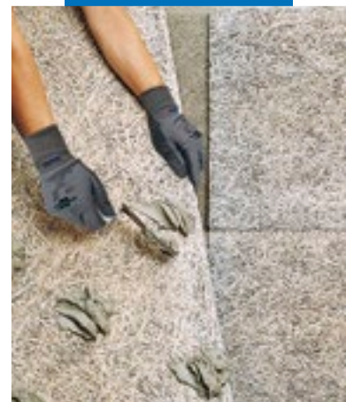
Laying heavy insulation panels