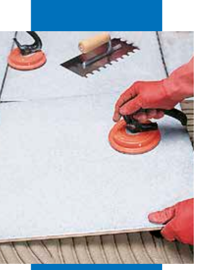
Laying large size tiles

Spreading with semicircular notched trowel